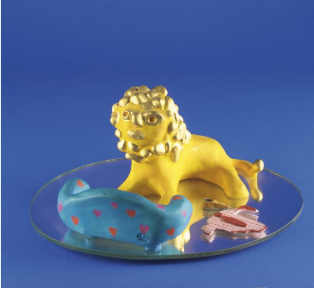
Niki de Saint Phalle – Le repas du Lion