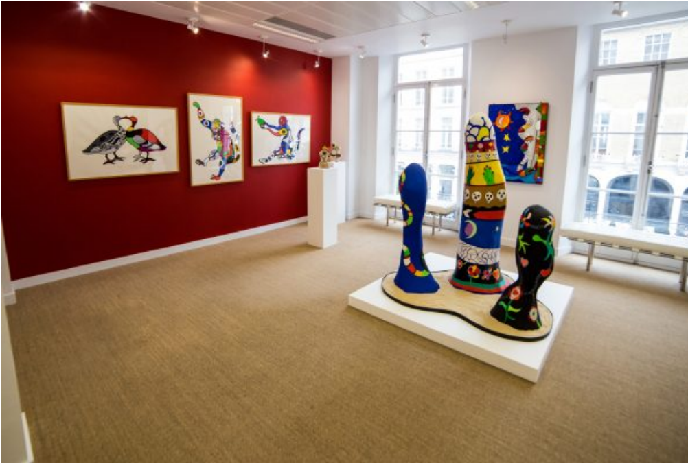
Niki de Saint Phalle.

Odalisques. There is an ingenuous playfulness that belies the turbulent life of the artist, and masks the diversity of cultural references implicit in the forms.