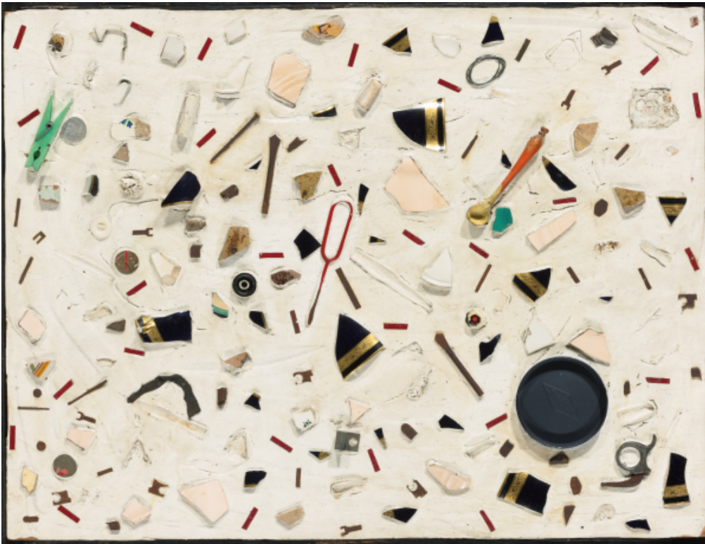
Niki de Saint Phalle – All Over.