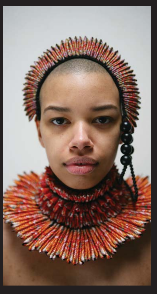
Speckled Crimson Ruff by Michelle Lowe-Holder, 'Flock & Fold' Collection AW11.

how fashionable dress has drawn on the beauty and power of nature for inspiration throughout history, with exquisite garments and accessories from Christian Dior, Dries van Noten and Philip Treacy. The exhibition looks to the past 400 years of fashion to explore what we can learn from fashion practice in the past. Items include an 1875 pair of earrings formed from the heads of two real Honeycreeper birds — a hugely popular item sold in enormous volume at the time — and an 1860s dress decorated with the iridescent green wing cases of hundreds of jewel beetles. For information visit <code>www.vam.ac.uk</code>