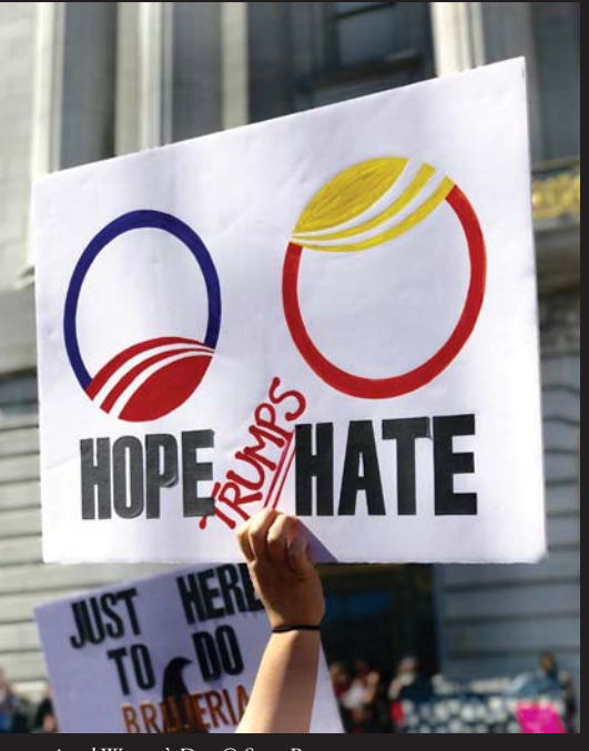
International Women's Day, © Steve Rapport

The global financial crash of 2008 followed by today's political landscape has shaken people's confidence in the prevailing order. Other areas of the world have witnessed similar upheavals, with events such as the Arab Spring and the refugee crisis having far-reaching political implications. These events have caused people to become more politically engaged than they have been for years, and social media has meant that they can disseminate political iconography as never before. Hope to Nope will explore the diverse methods that have been used to construct and communicate political messages over the past ten years. As traditional media rubs shoulders with the hash-tag and the meme, never has graphic design been more critical in giving everyone a political voice. For information visit www.designmuseum.org